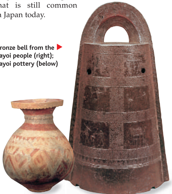
▶ Bronze bell from the Yayoi people (right); Yayoi pottery (below)